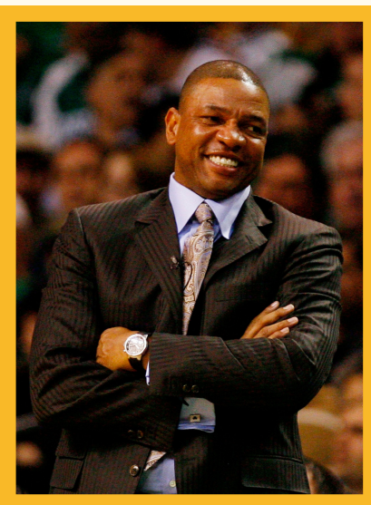
Doc Rivers Basketball Legacy Award