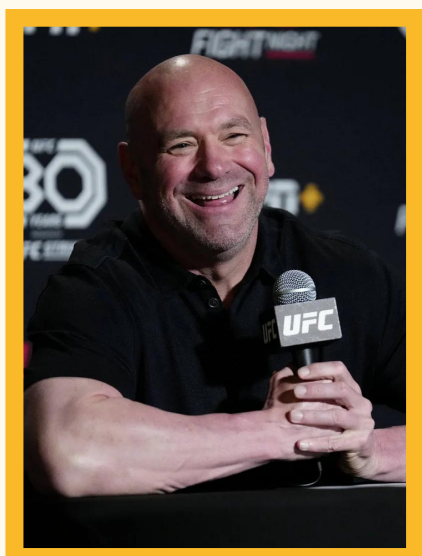
Dana White Special Achievement Award