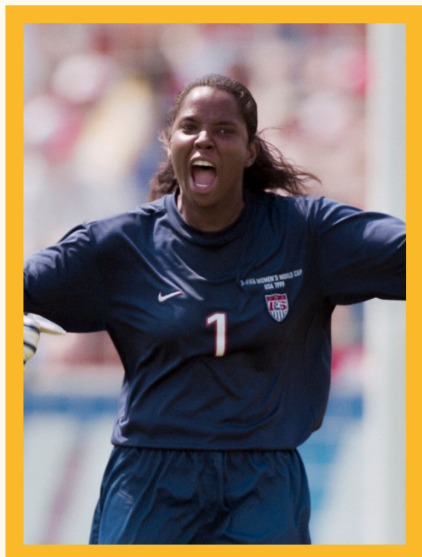
Briana Scurry Soccer Legacy Award