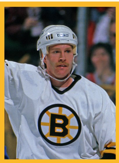
Bob Sweeney Hockey Legacy Award