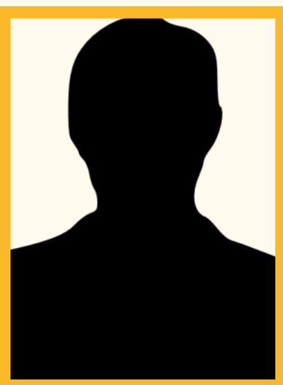
TBD Football Legacy Award